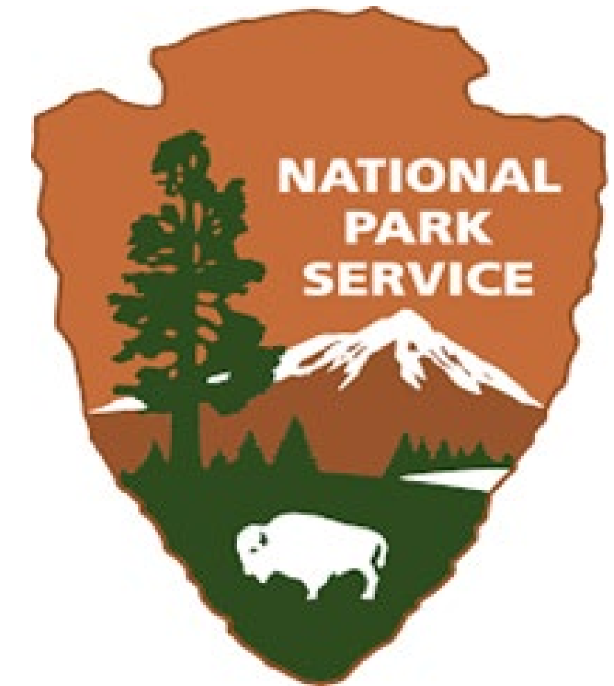
Title Services Agency: National Park Service

As part of the title commitment process, GGS identified all taxing districts and authorities with jurisdiction over the land. The firm ensured that all outstanding taxes were accounted for, establishing an escrow fund for unpaid taxes when necessary. Federal regulations required that all taxes be cleared before closing, and GGS handled this aspect meticulously, confirming all taxes were paid or escrowed before completing the acquisition.